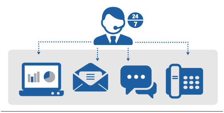
Figure 3. IntelliCare Proactive Support

Western Digital's team of storage experts leverage the knowledge gathered by IntelliCare cloud-based analytics to spot issues across the entire customer base. When a problem is detected, they know which arrays are affected and can take proactive measures to quickly resolve the issue. Those measures include notifying customers, fault reporting, opening a support ticket, and/or dispatching replacement parts.