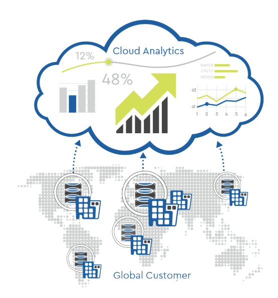
Figure 1. IntelliCare cloud-based analytics and data collection

IntelliCare collects millions of different data points from every IntelliFlash array in deployment that has opted in*, including capacity usage, configurations, and system health and performance. Servers in the cloud process and analyze data to