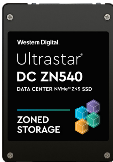
2.5-inch U.2, 15mm, NVMe™ ZNS SSD